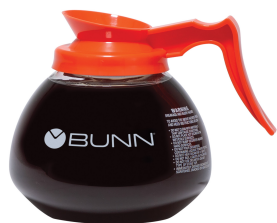
DECANTER, GLASS-ORN 12C 3/CS